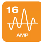
Connects to any 16A (3 phase) charging unit or station with a type 2 connection.

Charge at home and on the move Type 2 to Type 2 PIN | 3PHASE